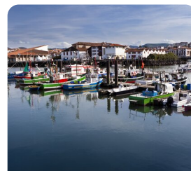
Saint Jean-de-Luz Delightful Seaside Town