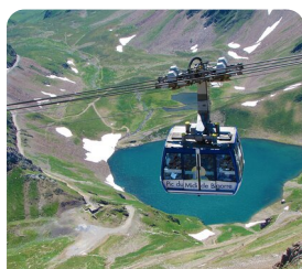
Pic du Midi Stunning Cable Car Ride