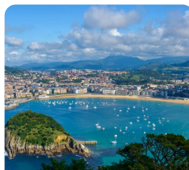
San Sebastian Guided Walking Tour