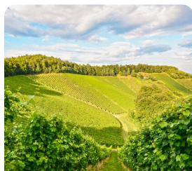
Rioja Wine region Scenic Drive & Wine Tasting

These are just a few of the very special hand selected experiences that will really make your touring experience exceptional and unique, and don't forget, with Albatross they are always included.