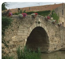
Le Somail Lunch beside the Canal du Midi