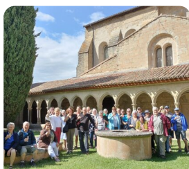
Abbey of St Hilaire 14th Century Cloisters