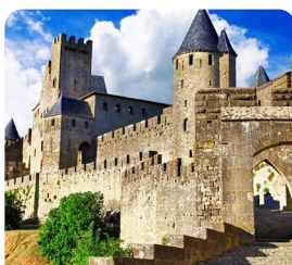
Carcassonne Guided Walking Tour