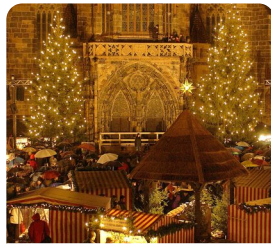
Nürnberg Christmas Markets