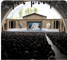
Oberammergau Passion Play Theatre Guided Tour