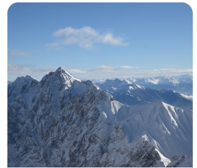
Zugspitze Funicular Train & Cable Car