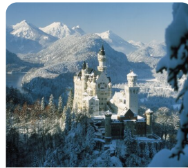
Neuschwanstein Castle Fairytale Castle of 'Mad' King Ludwig