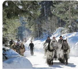
Filzmoos Horse Drawn Carriage Ride