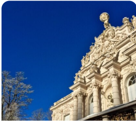
Linderhof Palace Guided Tour