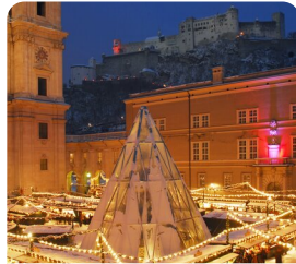
Salzburg Walking Tour & Christmas Markets