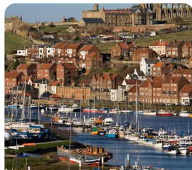
Whitby Visit Whitby Abbey & Fish & Chip lunch