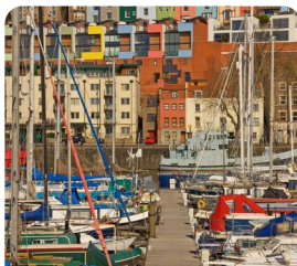
Bristol Harbour Cruise and visit SS Great Britain