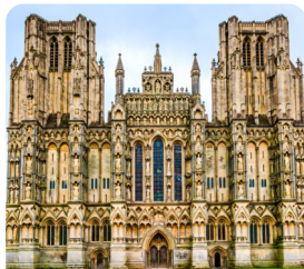
Wells Britain's Smallest City