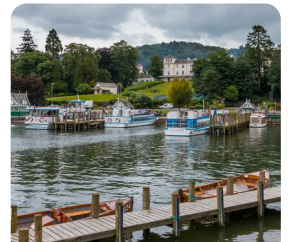
Lake District Sightseeing & a Scenic Lake Windemere Cruise