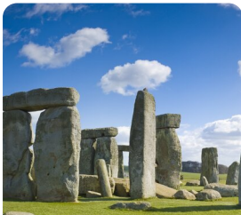
Stonehenge Medieval Salisbury & Sutton Veny

These are just a few of the very special hand selected experiences that will really make your touring experience exceptional and unique, and don't forget, with Albatross they are always included.