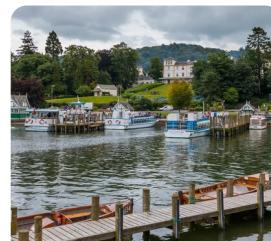
Lake District Sightseeing & a Scenic Lake Windemere Cruise