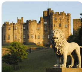
Alnwick Castle Guided tour