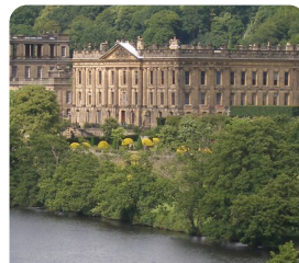
Chatsworth House Guided visit