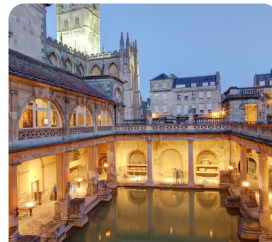
Bath Guided walking tour, & visits to Roman Baths and Bath Abbey