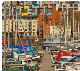
Bristol Harbour Cruise and visit SS Great Britain