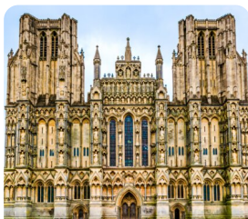
Wells Britain's Smallest City