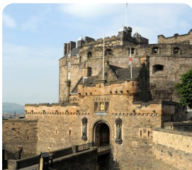
Edinburgh Royal Yacht Britannia & Edinburgh Castle