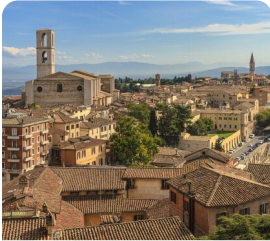
Perugia Explore the Heart of this Ancient City