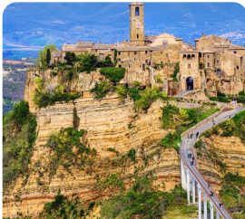
Civita di Bagnoregio A Mysterious Hilltop Town