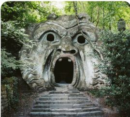
Sacro Bosco Park of the Monsters