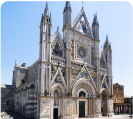
Orvieto Guided Walking Tour