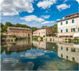
Bagno Vignoni Unique Hot Springs