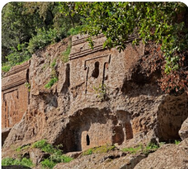
Tarquinia Guided tour of an Etruscan Necropolis

These are just a few of the very special hand selected experiences that will really make your touring experience exceptional and unique, and don't forget, with Albatross they are always included.