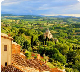
Val d'Orcia Explore Montepulciano & Pienza