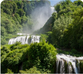
Waterfalls of Marmore Europe's highest man-made waterfalls

Correct as of 06:08 on 22nd December 2025