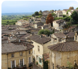
Saint-Émilion Guided tour and tasting