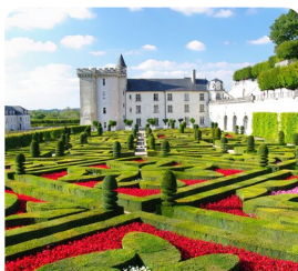
Château Villandry Magnificent Gardens