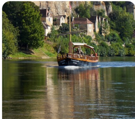
Dordogne Sarlats & La Roc Gageac