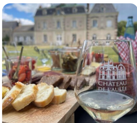
Château picnic lunch A picnic in the Loire vineyards under a shady tree