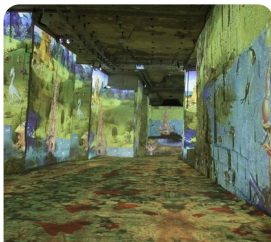
Les Baux spectacle The extraordinary Carrières de Lumières show