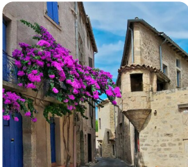
Pézenas Preserved medieval town in the South of France