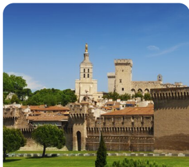
Avignon & Pont du Gard 'City of the Popes' & Ancient Roman Aqueduct