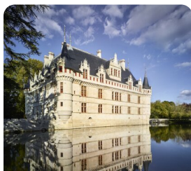
Loire Valley Châteaux 4 very special visits

These are just a few of the very special hand selected experiences that will really make your touring experience exceptional and unique, and don't forget, with Albatross they are always included.