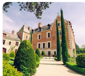
Amboise Da Vinci's Residence