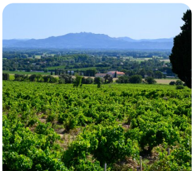
Chateauneuf-du Pape Rhône region vineyard visit