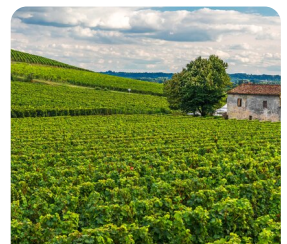
Bordeaux Saint-Émilion vineyard tasting and lunch