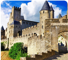
Carcassonne Guided Walking Tour