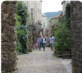
Millau La Couvertorade, Millau Viaduct & Roquefort cheese