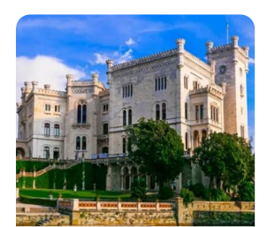
Castello di Miramare Nature & History

These are just a few of the very special hand selected experiences that will really make your touring experience exceptional and unique, and don't forget, with Albatross they are always included.