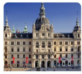
Graz The Stallbastei bastion and Styrian Armoury