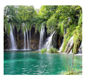
Plitvice Both the upper and lower falls