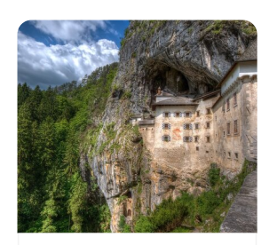
Predjama Castle A cliff clinging castle