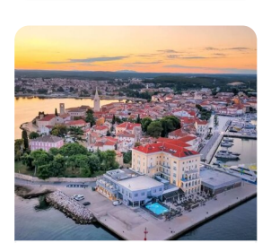
Poreč An Istrian jewel