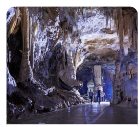
Postojna Caves Mesmerizing cave adventure