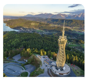
Pyramidenkogel Observation Tower