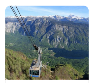
Lake Bohinj Vogel cable car ride